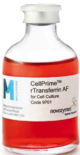
Pharmaceutical companies want to go animal free in order to avoid risks. The AF in the product name stands for "animal free."

The disadvantage of providing free iron on its own in the form of iron salts is that the iron can induce the formation of free radicals in the